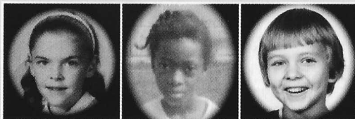
Award-winning fiction for Middle Grades